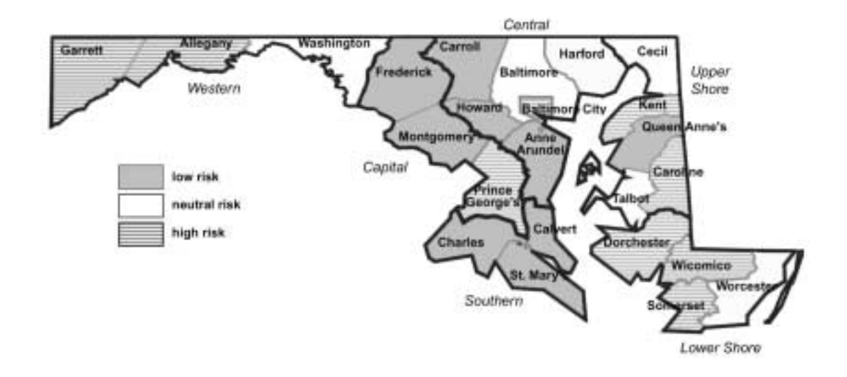
Figure 1. Map of jurisdictional risk categories

their designated category. This designation was created to enable a more succinct examination of potential patterns of FVO implementation at the jurisdictional level.